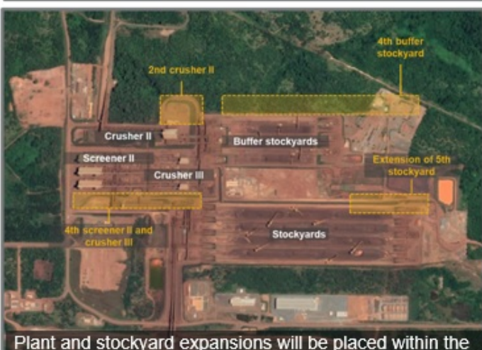
Plant and stockyard expansions will be placed within the current operational area.