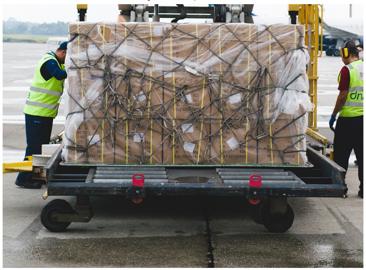
The shipment of 500 thousand units, from China, arrived at the International Airport of Guarulhos this Monday

The test - produced by the Chinese company Wondfo - is registered at the National Health Surveillance Agency (Anvisa, Agência Nacional de Vigilância Sanitária) and can present a result in just 15 minutes. The kits acquired by Vale will be donated to the Brazilian government, which will take care of the distribution logistics in the country.