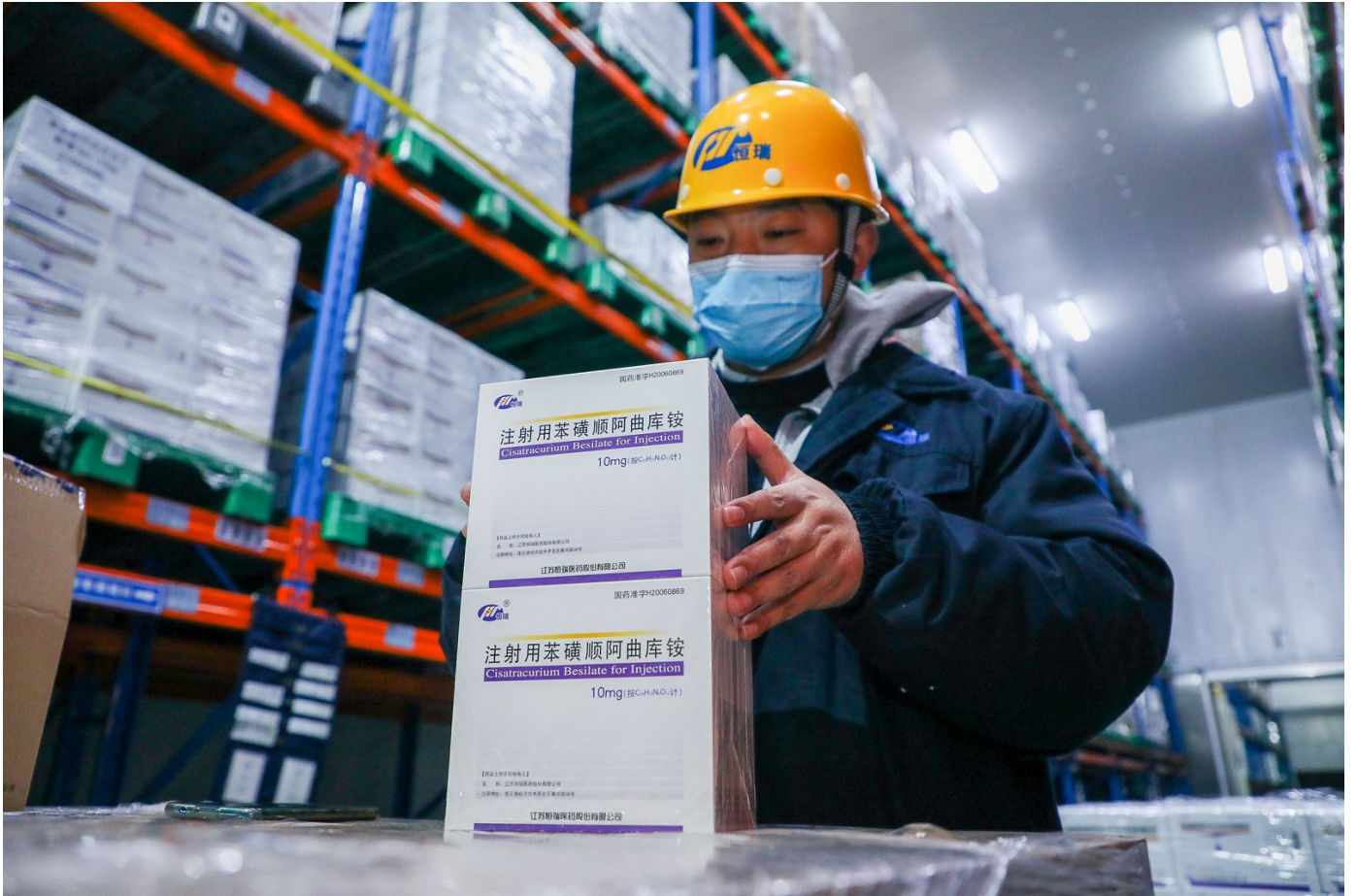
Manufacturing of intubation medicines in Lianyungang, China