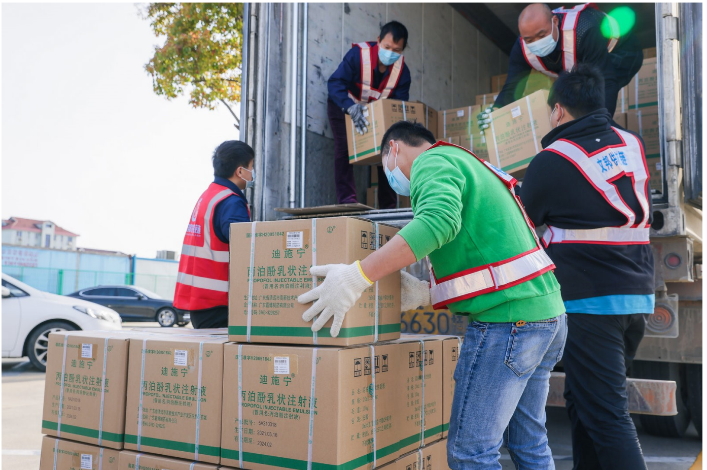
Medicines arriving at the warehouse in Shanghai, China