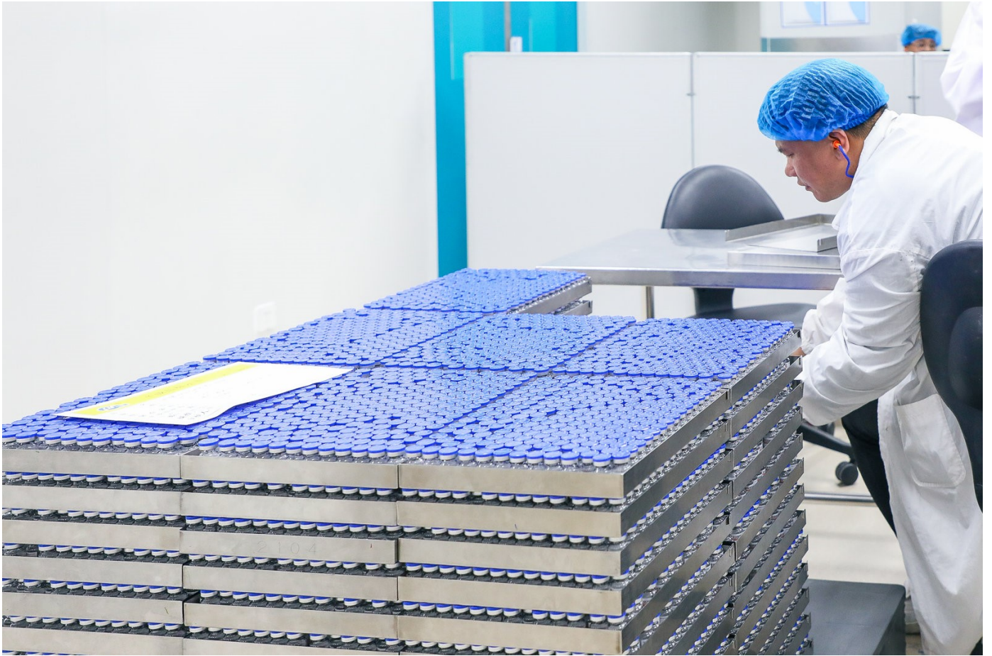
Manufacturing of intubation medicines in Lianyungang, China